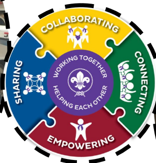
The NZ22 Jamboree Values

Mystery Tours (offsite) – Our patrol did rock-climbing, laser tag, jump and orientating around Hamilton Gardens.